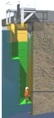
Section view of limpet dam model