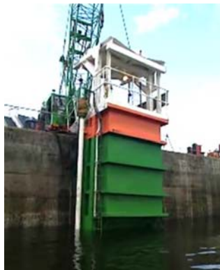
Limpet Dam in use

The works involve repairing the existing riverside quay wall using a Limpet Dam. This is a temporary structure that enables access to the quay sheet piles during all states of tide, and uses the water pressure on the sides of the structure to attach itself to the quay wall. It allows us to inspect and repair the river wall in a dry environment that would otherwise be underwater. Small construction equipment and a large crane will move the Limpet Dam along the wall as work progresses. The works are not expected to cause undue noise or disruption.